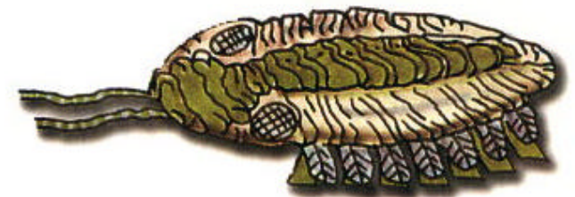
Completed model Trilobite